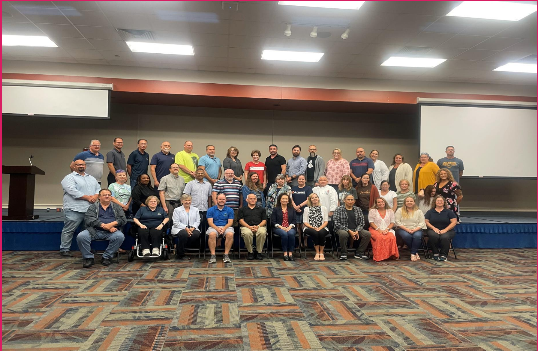
The Richland Faculty